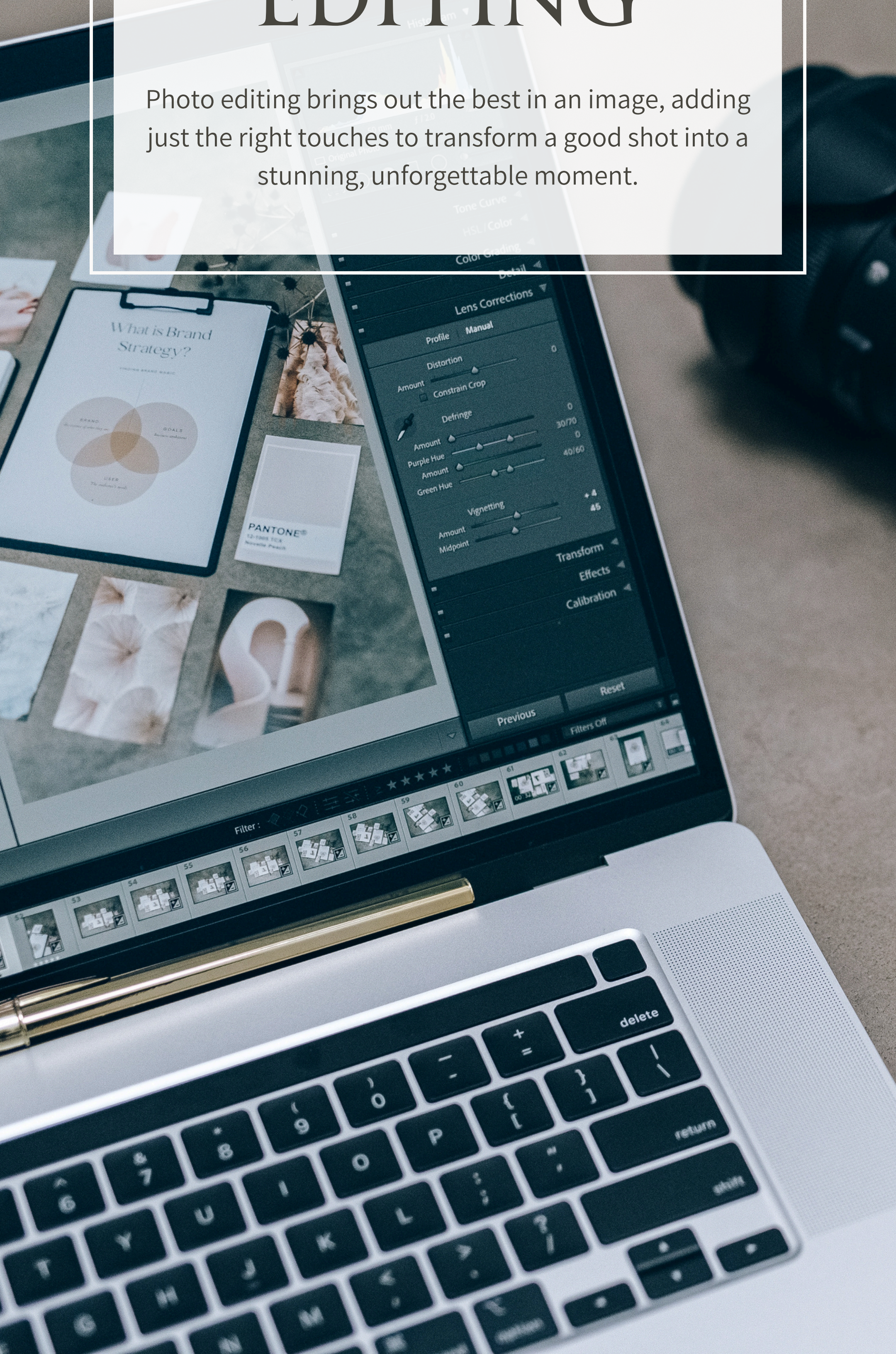
Photo editing brings out the best in an image, adding just the right touches to transform a good shot into a stunning, unforgettable moment.